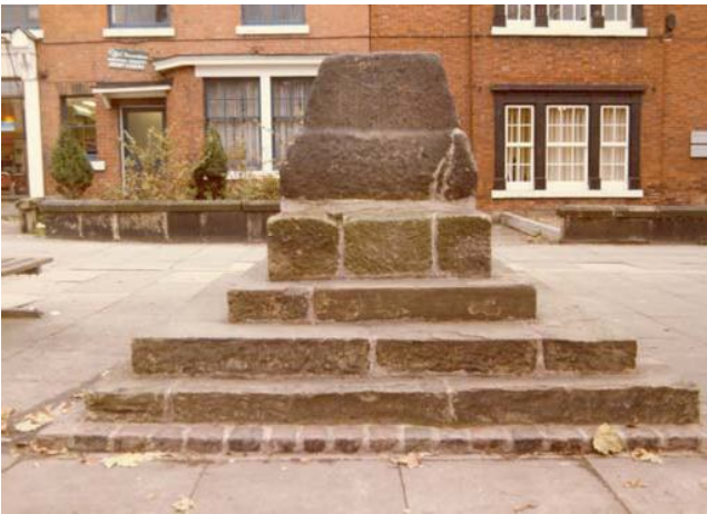
Headless Cross, Friar Gate, Derby

A Priory of the Convent of St Mary de Pratis was also located near Friar Gate and gave its name to Nun's Street and Nun's Green, which occupied a large space on the north side of Friar Gate from the Headless Cross as far as Ford Street.