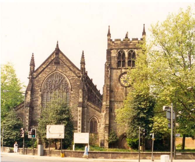
St Werburgh's Church, Friar Gate, Derby