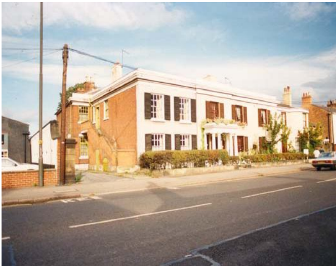
Georgian House Hotel, Friar Gate, Derby

The Church of St Werburgh at the eastern entrance to Friar Gate is believed to have originated on this site from the 8 th century, but the earliest part of the existing building is the tower of 1610. The Church takes its name from the sister of King Aethelred of Mercia who was Abbess of Ely and died at Trentham in 699. The tower survived flooding in 1698 but a new Queen Anne style church was built, (of which only the chancel now survives), only to be replaced in 1893 by the present building to the designs of Sir Arthur Blomfield RA. Samuel Johnson, the famous man of letters, married