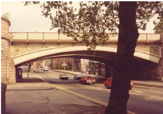
Friar Gate Bridge, Friar Gate, Derby