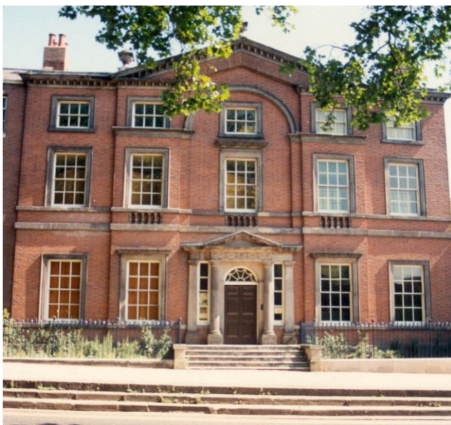
Pickfords House, Friar Gate